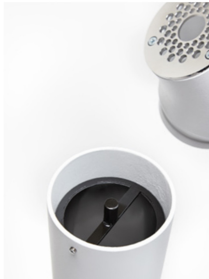
ASHTRAY TOP REMOVABLE – LAX 01