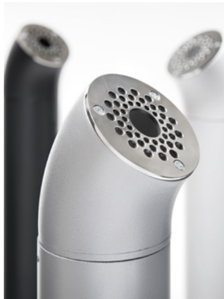
DETAIL OF UPPER LID – LAX 01 + 9006